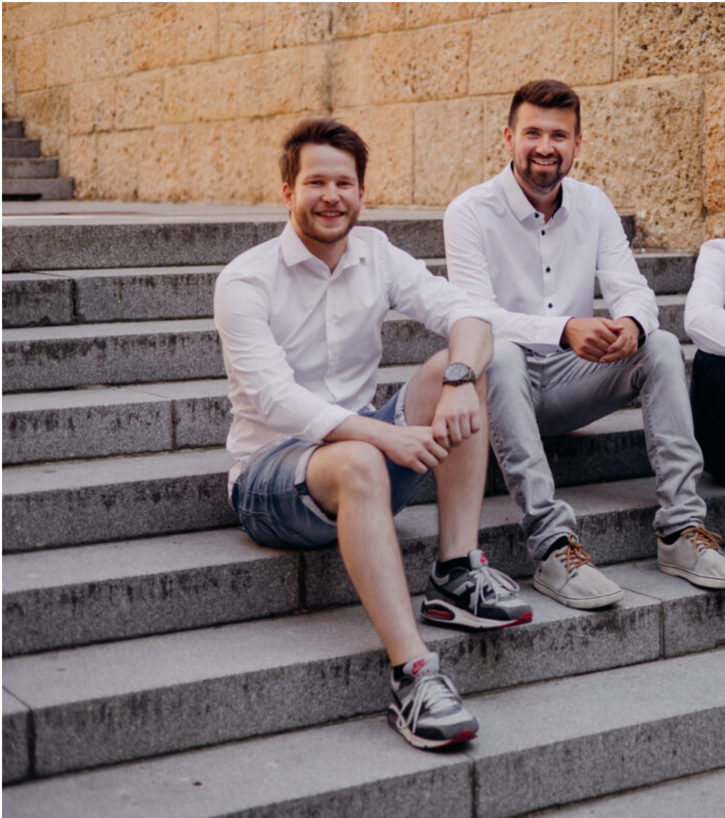
Team Kraken Innovations

We create new possibilities for existing applications which, thanks to our drive solution, will be fit for the integrated production of the future.