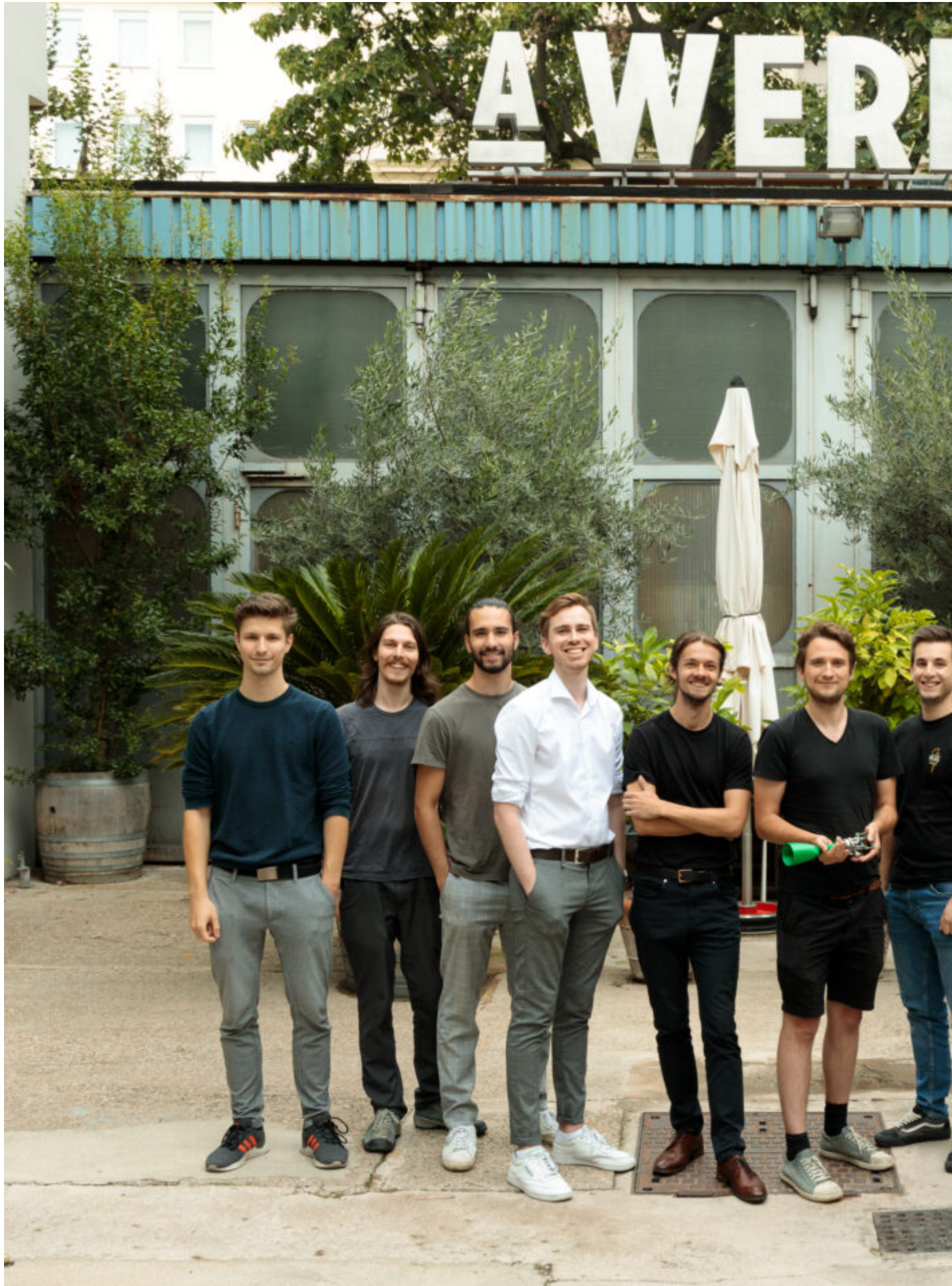
Team GATE Space