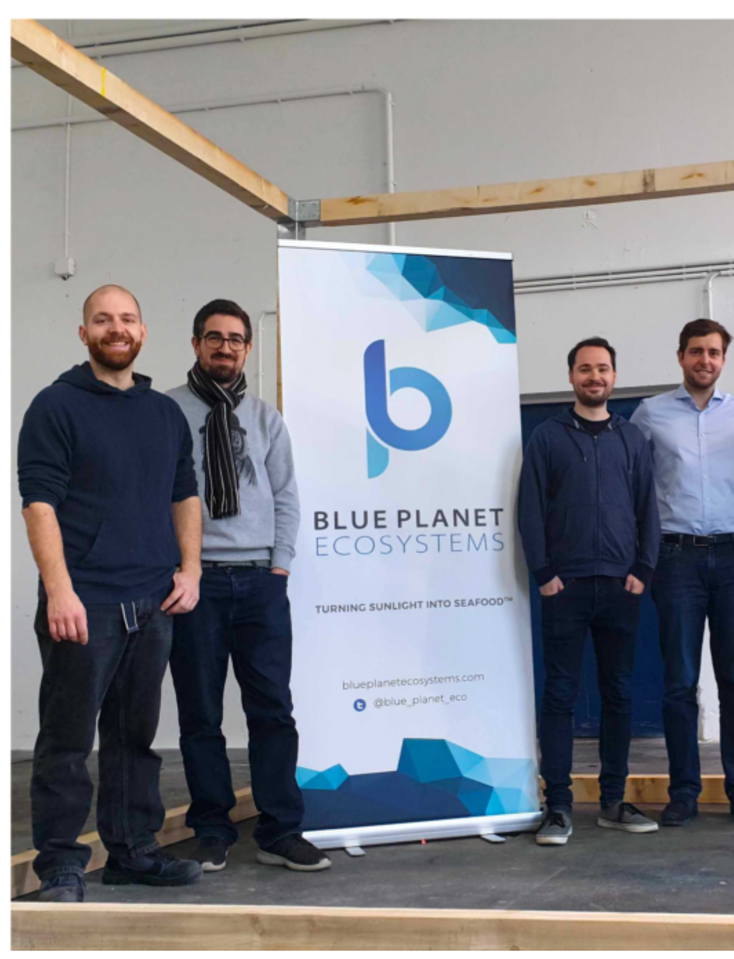
Team Blue Planet Ecosystems

Contact: Office (<u>blueplanetecosystems@gmail.com</u>)